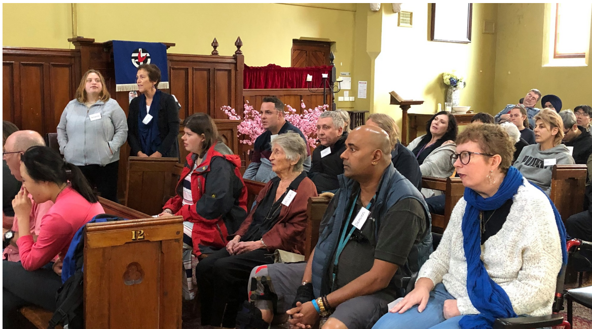
How we began 2020.

Early in the year, we were looking forward to celebrating our tenth anniversary in May when the first lockdown due to Covid-19 began in mid-March. Everything changed. We were able to meet briefly at our long-term rehearsal space in the Northcote Uniting Church ('Chalice') one last time before cancelling the last session of Term 1. Unfortunately that session included our Annual General Meeting, which was postponed.